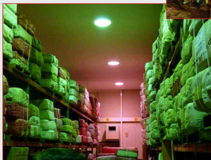
Tobacco hanging warehouse ... Tobacco fermentation ... Tobacco storage.